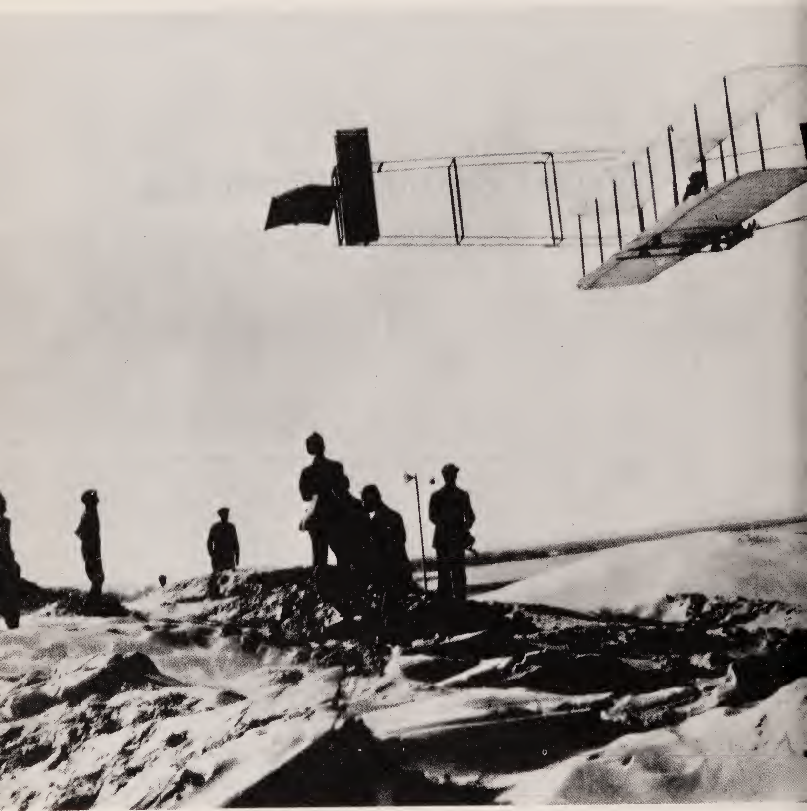
Orville Wright at the controls of the Wright glider in 1911 at Kitty Hawk, N.C.